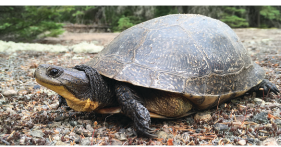
Blanding's Turtle 001 was first found by researchers in 1991 and is currently presumed to be 34 years old. She was observed searching for a nest site on June 28, 2019.

Blanding's Turtles are rare in Algonquin's research in Michigan, this means she may continue to reproduce for at least another fifty vears! Plod on, Blanding's Turtle 001—cheers to your success so far, and here's to many more.