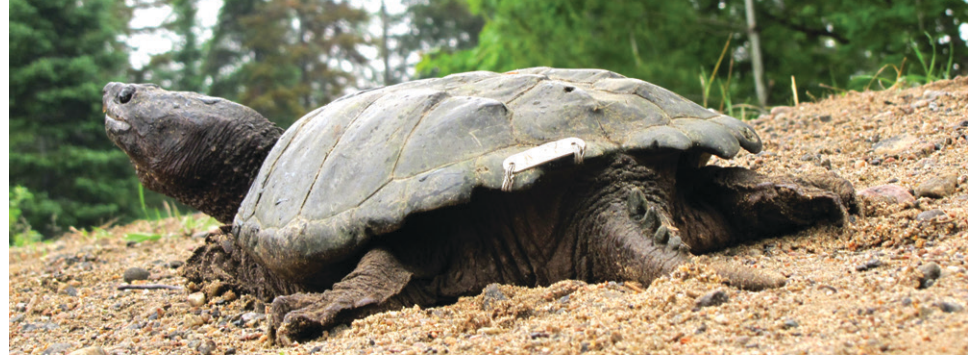
This turtle, A7 has been part of the study since its beginning.

Snapping Turtles, on the other hand, have evolved to spread their reproductive effort over many decades—they hedge their bets. The key to this strategy is high adult survival. In a typical year, an adult Snapping Turtle nesting at the Wildlife Research Station has around a 94 - 98% chance to be around to nest the next year too. As she gets older she might get bigger, which means she can lay more and bigger eggs and her chances of survival get even better. Altogether, high adult survival combined with a low rate of successful reproduction and juveniles that take a long time (about 20 years) to reach sexual maturity results in an extremely stable adult population that typically doesn't change much from one year to the next. If the populations of animals such as Wood Frogs are like rubber dinghies that speed to the top of each cresting wave only to plunge into the