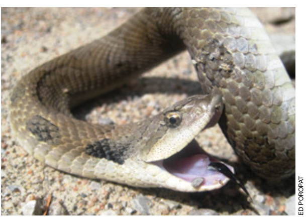
A Hog-nosed Snake in the act of playing dead during which it writhes about, mouth agape and tongue hanging, flips upsidedown, and opens up the cloaca (the anus) to smear foul-smelling fluids all over the body before finally coming to a jarring "death".

Let's begin our investigation by examining some historical elements from Algonquin's past. Between the mid-1800s right up until the early 1900s Algonquin was recklessly logged, and as a result of the huge quantities of driedout brush left behind by the lumbermen, fires were a regular phenomenon. Both the removal of trees and the burning of the leftover slash