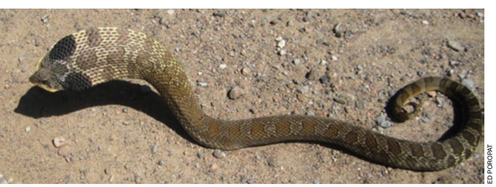
A Hog-nosed Snake flaring its neck out as part of a dramatic, but heavily-bluffed, defensive display.

the thing that propels it into the stuff of legend is not its size, but rather its bizarre defensive behaviour that it exhibits when confronted by a predator (or curious human!). Flaring out the neck into a flattened, cobra-like position, hissing and puffing with alarming volume, and making mock-strikes (though the Hognose will not bite), most would-be predators are frightened away early on in the encounter. If the predator is persistent, the Hognose will "play dead", during which it writhes about, mouth agape and tongue hanging, flips upside-down, and opens up the