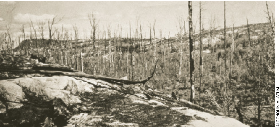
Algonquin's landscape has undergone a dramatic history. Historically, large areas of the Park appeared like this--places where fires induced by reckless logging practises swept through, converting forested habitat to open and sunny rock outcrops with regenerating growth.

led to the conversion of Algonquin from a land of mature, cool, shady forest to one of clearings, bare rock, and sunshine—excellent habitat for the Hog-nosed Snake. Whether they were found here ancestrally in extremely low numbers is not known, but it is certain