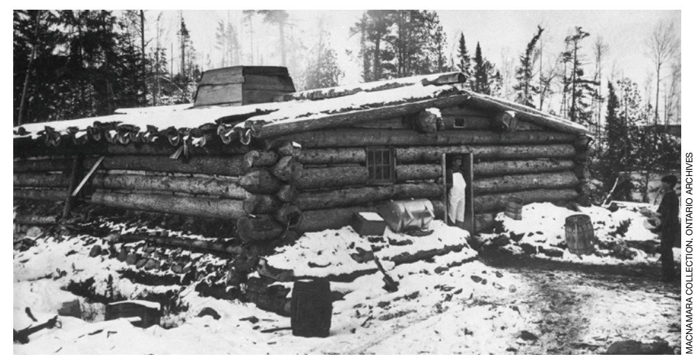
A camboose from 1900.

the shantymen, a replica of a shanty and its camboose should match the historical record. When the Algonquin Logging Museum shanty was constructed in 1992, flat rocks were used to hold back the sand of the camboose. It was discovered that arrangement did not match with the four existing nineteenth century photographs of shanty interiors or with first-hand accounts, which indicated that in most shanties large beams of wood surrounded the camboose. The beams were lower than the rock wall that had been used in the replica camboose.