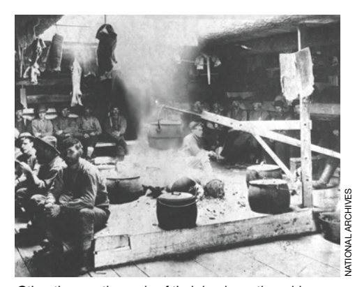
Other than on the ends of their bunks or the odd bench, one of the few places the shantymen could sit while eating was on the wooden beams surrounding the camboose.

merely an "academic" question until repairs began. Fortunately, independent archaeological research could answer the question. Work on an 1871 camboose shanty along the Madawaska River was conducted by the author, who is a former seasonal naturalist and current research archaeologist, with permission of Park authorities and under license by the Ministry of Tourism, Culture and Sport. (The artifacts are held in the Algonquin Park Visitor Centre.)