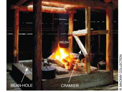
The new configuration of the Algonquin Logging Museum camboose, with the cramier and bean-hole.

Careful excavation of a sandy mound – the former camboose – centrally located within a rectangular set of foundation mounds revealed that the sand of that camboose was held in place by the remains of log beams on all four sides. There was no evidence of vertical posts, but apparently not all shanties had them. Near the top of the sand there were also large