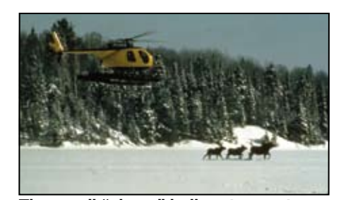
The small "chase" helicopter spots moose on a frozen lake.

Before doing that, however, we need to explain why the project was undertaken in the first place. To understand that you have to know how remarkably similar the release site of the transferred moose, in the Upper Peninsula of Michigan, is to Algonquin Park. Not only do the Upper Peninsula's forests