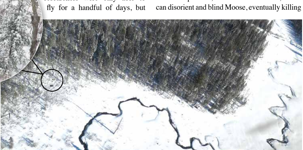
Even in winter, Moose can be hard to spot from the air. Note the size difference between the cow (below) and calf (above).

Now that we have a confident estimate of the number of Moose roaming Algonquin's forests by February 2015, what does that really tell us? Like all wildlife populations, Algonquin's Moose are subject to fluctuations over time. In the early days of trying to estimate the Moose population back in the 1950s, there were roughly 500. In contrast to low Moose numbers at this time, White-tailed Deer numbers were exceptionally high. It is important to remember that from the late 1800s to the 1950s, the Park actively killed wolves. Few wolves meant that deer numbers could grow rapidly. White-tailed Deer can also transmit a parasite, known as Brainworm, which can disorient and blind Moose, eventually killing