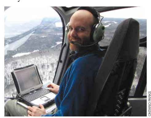
A Moose researcher recording data from the cockpit of a helicopter, high above the Algonquin landscape.

may be harvested sustainably. In other areas, where wildlife isn't hunted, these populations offer biologists a look at a more natural situation. Moose live in our vast Park which makes it difficult for us to get to most areas, and Moose can conceal themselves easily in the forest. So how can we get an answer to our question: How many Moose live in the Park?