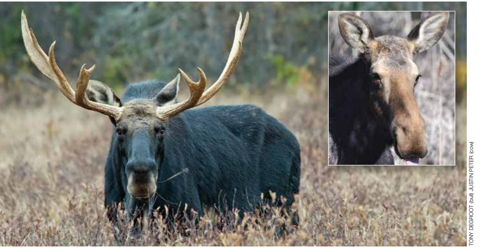
Differences in face colour can be useful in telling males from female Moose. Note the dark face (and antlers) of the bull versus the light face of the cow.

them. When deer are abundant, competition and disease usually prevent Moose from becoming abundant. By the 1960s, the Park had changed its ideas about wolves and no longer killed them. Wolves preyed extensively on deer, allowing Moose numbers to increase. Wolves do prey upon Moose, but show a preference for deer in Algonquin.