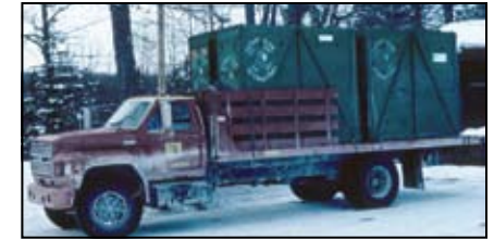
At day's end, any captured moose were transported in crates by truck to the release site in Michigan.

All this sounds straightforward enough but the use of drugs is a tricky business at the best of times and no operation of this magnitude had ever been attempted before. The project planners believed that 10-20% of the animals would be lost due to drug and handling-related stress and that it would take two years to transfer the desired 30 or so moose. In fact, 29 animals (10 bulls, 19 cows — of which 18 at least were pregnant) were transferred in just two weeks, far surpassing the most optimistic predictions and making it unnecessary to stage a repeat program next winter. Another five animals, unfortunately, were lost (three in the Park and two shortly