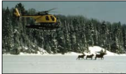
The small "chase" helicopter spots moose on a frozen lake.

Originally printed on April 25, 1985, we are pleased to reprint this slightly edited version of The Raven and also provide an update on Algonquin's moose.