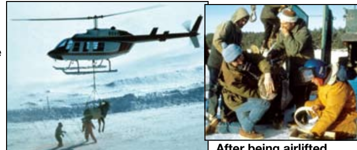
After being airlifted to Mew Lake, the moose were "processed and prepared" for their long journey to Michigan.

** In 2009, the moose population in Algonquin was estimated to be 3,200.