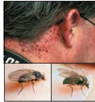
Blackfly bites can look and feel painful. Blackfly biting (L) and mosquito feeding (R)

(Note: not at actual size!)